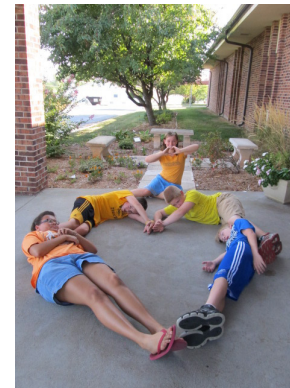
Youth forming a heart shape